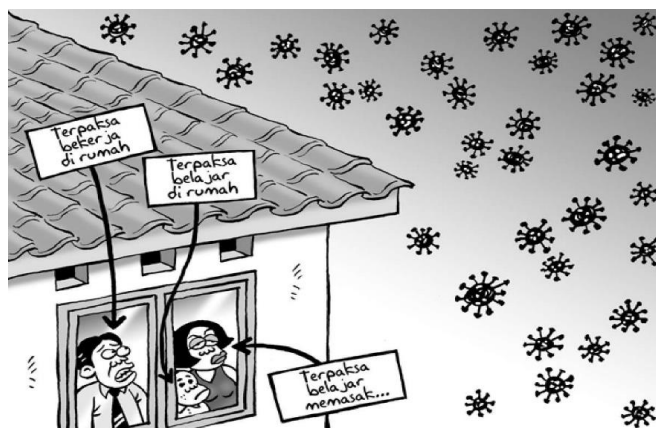
Figure 2. picture of Kartun Benny edition 18 th of March 2020

analyzed by using the semiotics theory of Peirce based on the second trichotomy which is the object that includes icon, index and symbol.