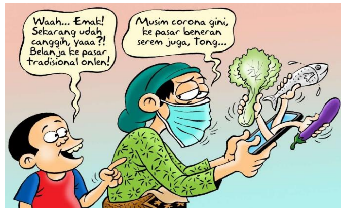
Figure 4. picture of Kartun Benny edition March 29 th , 2020

First, the picture seen from the icon showed in the cartoon. A woman (mom) and a boy (son) are seen in the picture, while the woman is operating a smartphone. The son is pointing to the smartphone hold by his mom while talking to his mom, he seems happy. On the picture, the outfits of the woman are kain or jarik and kebaya . Those outfit is usually wearing by traditional woman, or a person who comes from middle class living in an area for lower class in a city. The boy is wearing a t-shirt. It means that his daily life outfit is a casual or simple. From those outfits, wearing by the mother and the son, it can be seen that they are not coming from rich family, they are one of the people who affected by the spreading of coronavirus.