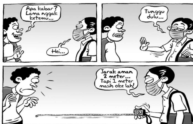
Figure 3. picture of Kartun Benny edition 21 st of March 2020

Kartun Benny published this cartoon on 18 th of March 2020. Indonesian Government published the instruction to stay at home, work from home, study at home since 16 th of March 2020. From this cartoon, there is no sense of against the government, or give critic to the government. The cartoon shows only how the society now do their usual activities after the spreading of coronavirus, after the instruction from the government. This cartoon is also a humorous cartoon, seeing from how Kartun Benny describe the shape of the virus, how the expressions of the family members, and the writing, especially the writing from the mother, that she must learn how to cook in this condition.