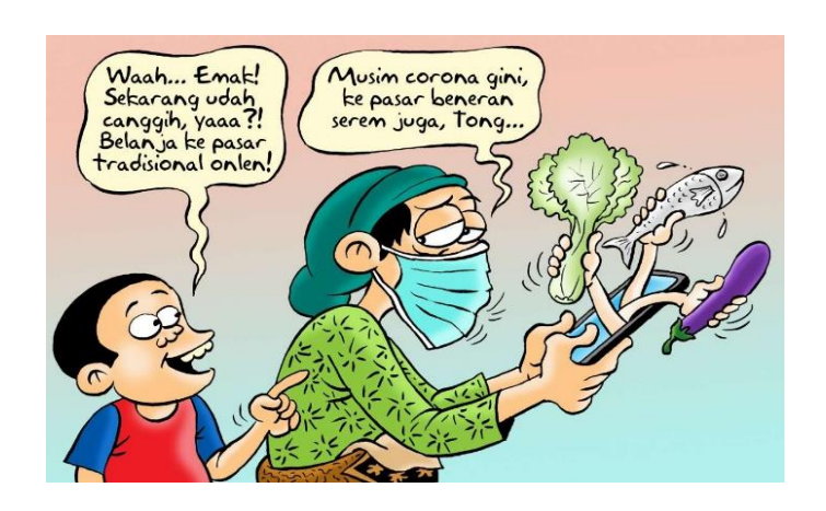
Figure 4. picture of Kartun Benny edition March 29th, 2020

First, the picture seen from the icon showed in the cartoon. A woman (mom) and a boy (son) are seen in the picture, while the woman is operating a smartphone. The son is pointing to the smartphone hold by his mom while talking to his mom, he seems happy. On the picture, the outfits of the woman are kain or jarik and kebaya. Those outfit is usually wearing by traditional woman, or a person who comes from middle class living in an area for lower class in a city. The boy is wearing a t-shirt. It means that his daily life outfit is a casual or simple. From those outfits, wearing by the mother and the son, it can be seen that they are not coming from rich family, they are one of the people who affected by the spreading of coronavirus.