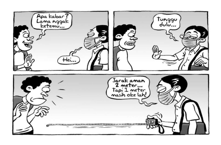
Figure 3. picture of Kartun Benny edition 21st of March 2020

Kartun Benny published this cartoon of March 2020. Indonesian on Government published the instruction to stay at home, work from home, study at home since 16<sup>th</sup> of March 2020. From this cartoon, there is no sense of against the government, or give critic to the government. The cartoon shows only how the society now do their usual activities after the spreading of coronavirus, after the instruction from the government. This cartoon is also a humorous cartoon, seeing from how Kartun Benny describe the shape of the virus, how the expressions of the family members, and the writing, especially the writing from the mother, that she must learn how to cook in this condition.