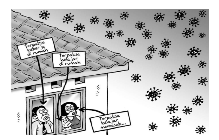
Figure 2. picture of Kartun Benny edition 18th of March 2020

analyzed by using the semiotics theory of Pierce based on the second trichotomy which is the object that includes icon, index and symbol.