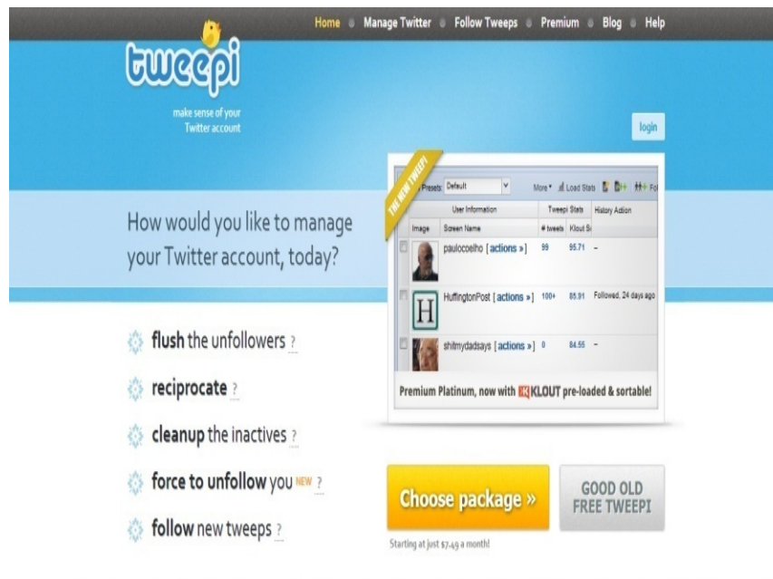
Figure 1. The Home Page of Tweepi

We used questionnaires to do this research. We also used the tool to clarify their Following list by using Tweepi.com , so we would know the percentage of the L1 they follow on Twitter.